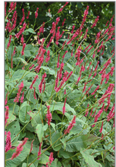
Fire Tail Fleeceflower flowers