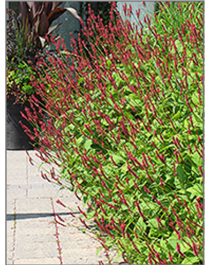
Fire Tail Fleeceflower in bloom

Fire Tail Fleeceflower is recommended for the following landscape applications;