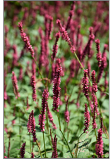
Fire Tail Fleeceflower flowers

This plant does best in full sun to partial shade. It is quite adaptable, preferring to grow in average to wet conditions, and will even tolerate some standing water. It is not particular as to soil type or pH. It is highly tolerant of urban pollution and will even thrive in inner city environments. This is a selected variety of a species not originally from North America. It can be propagated by division; however, as a cultivated variety, be aware that it may be subject to certain restrictions or prohibitions on propagation.