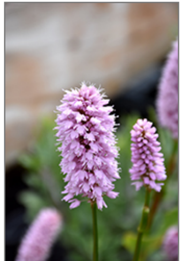
Pink Snakeweed flowers