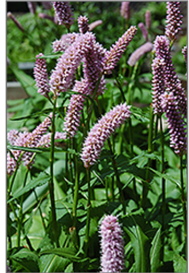
Pink Snakeweed flowers