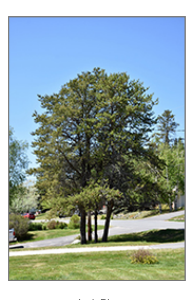
Jack Pine

Jack Pine will grow to be about 45 feet tall at maturity, with a spread of 35 feet. It has a low canopy with a typical clearance of 4 feet from the ground, and should not be planted underneath power lines. It grows at a slow rate, and under ideal conditions can be expected to live for 80 years or more.