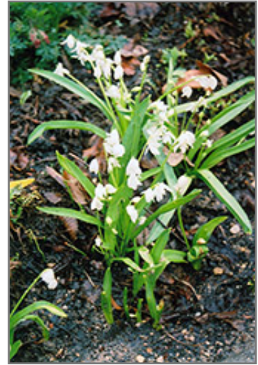
White Spring Squills in bloom

White Spring Squills will grow to be only 4 inches tall at maturity extending to 6 inches tall with the flowers, with a spread of 4 inches. It grows at a fast rate, and under ideal conditions can be expected to live for approximately 5 years. As an herbaceous perennial, this plant will usually die back to the crown each winter, and will regrow from the base each spring. Be careful not to disturb the crown in late winter when it may not be readily seen! As this plant tends to go dormant in summer, it is best interplanted with late-season bloomers to hide the dying foliage.