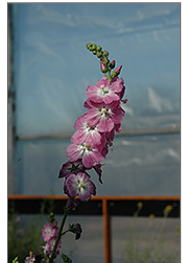
Stark's Hybrids Prairie Mallow flowers