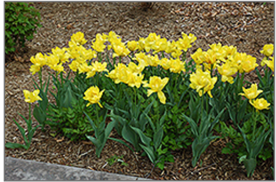
Monte Carlo Tulip in bloom