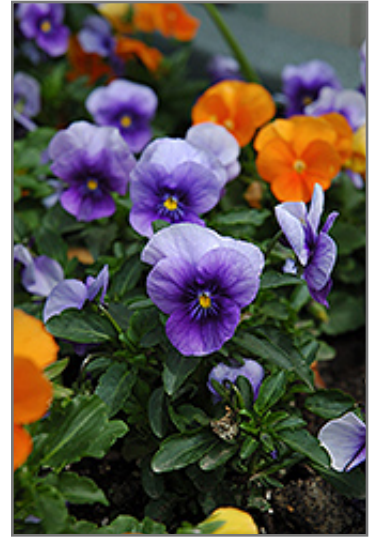
Velour Blue Pansy flowers