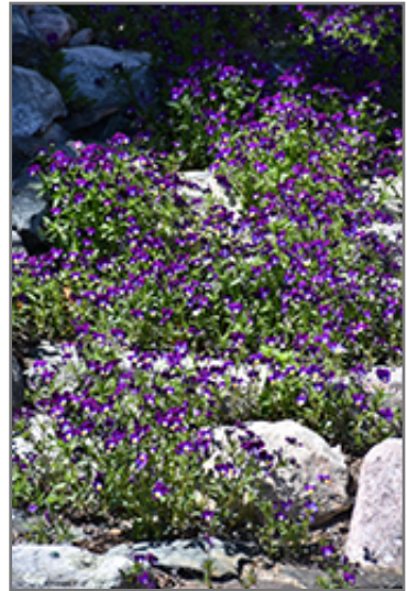
Johnny Jump-Up in bloom