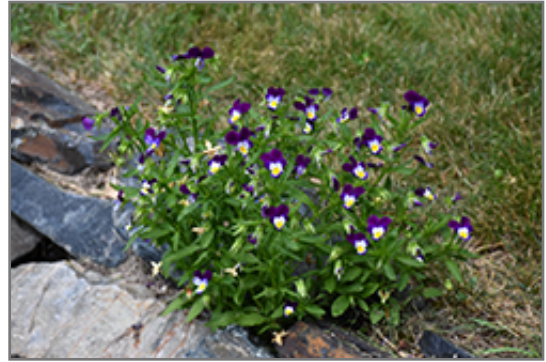
Johnny Jump-Up in bloom

Johnny Jump-Up will grow to be only 4 inches tall at maturity extending to 6 inches tall with the flowers, with a spread of 6 inches. When grown in masses or used as a bedding plant, individual plants should be spaced approximately 5 inches apart. It grows at a fast rate, and tends to be biennial, meaning that it puts on vegetative growth the first year, flowers the second, and then dies. However, this species tends to self-seed and will thereby endure for years in the garden if allowed. As an herbaceous perennial, this plant will usually die back to the crown each winter, and will regrow from the base each spring. Be careful not to disturb the crown in late winter when it may not be readily seen!