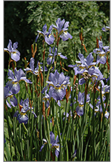
Gatineau Siberian Iris in bloom

Gatineau Siberian Iris will grow to be about 24 inches tall at maturity extending to 32 inches tall with the flowers, with a spread of 24 inches. When grown in masses or used as a bedding plant, individual plants should be spaced approximately 18 inches apart. It grows at a medium rate, and under ideal conditions can be expected to live for approximately 10 years. As an herbaceous perennial, this plant will usually die back to the crown each winter, and will regrow from the base each spring. Be careful not to disturb the crown in late winter when it may not be readily seen!