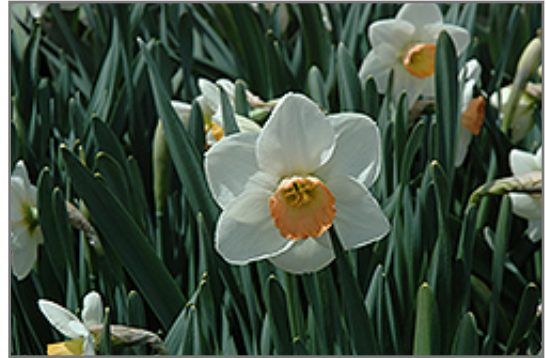
Fragrant Rose Daffodil flowers