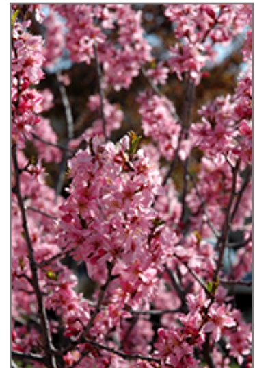
Muckle Plum (tree form) flowers