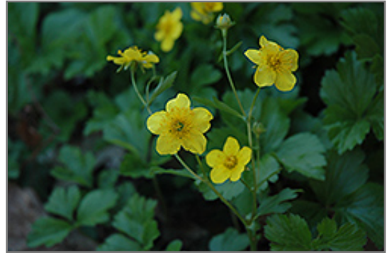
Barren Strawberry flowers