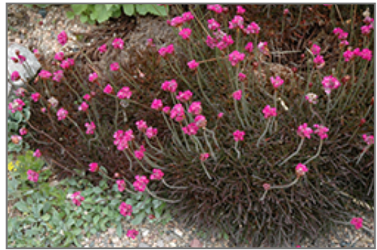
Red-leaved Sea Thrift in bloom