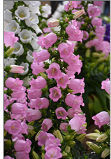
Champion Pink Canterbury Bells flowers