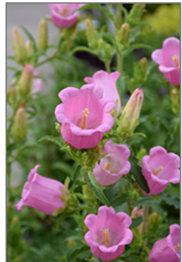
Champion Pink Canterbury Bells flowers