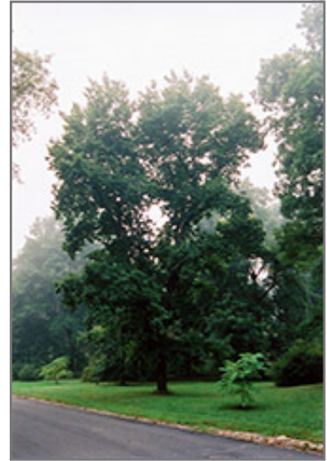
Bitternut Hickory

Considered by many to be the hardiest hickory, this is a massively tall and narrow tree, best used for natural forests and larger landscapes; fall color can be spectacular; large nuts are very bitter and can be messy in fall