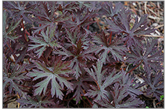
Hocus Pocus Cranesbill foliage