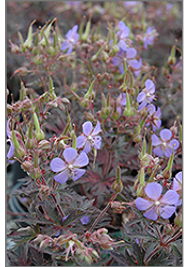
Hocus Pocus Cranesbill flowers

This is a relatively low maintenance plant. Trim off the flower heads after they fade and die to encourage more blooms late into the season. It is a good choice for attracting butterflies to your yard, but is not particularly attractive to deer who tend to leave it alone in favor of tastier treats. It has no significant negative characteristics.