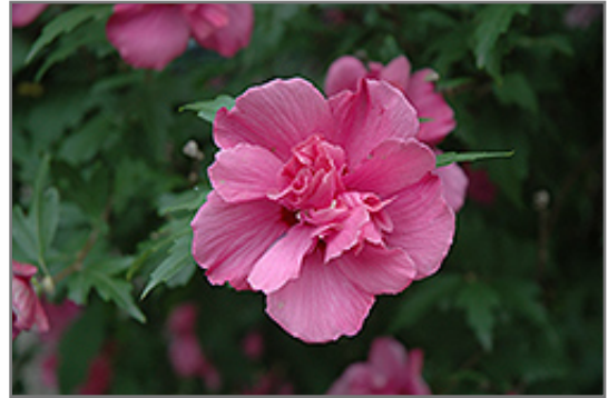
Lucy Rose Of Sharon flowers

Lucy Rose Of Sharon is recommended for the following landscape applications;