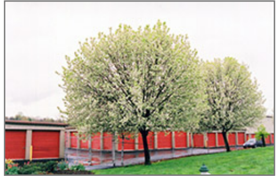
Bradford Ornamental Pear in bloom

Bradford Ornamental Pear is recommended for the following landscape applications;