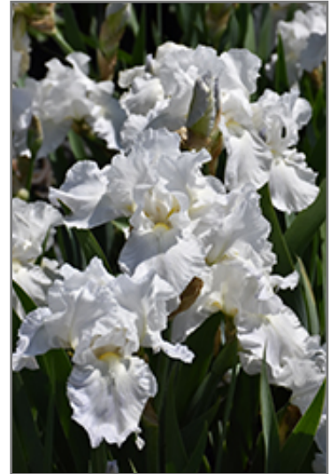
Immortality Iris flowers

Immortality Iris features bold white flag-like flowers with a buttery yellow beard at the ends of the stems in mid spring. The flowers are excellent for cutting. Its sword-like leaves remain green in color throughout the season.