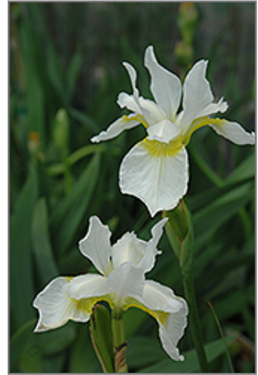
Snow Queen Siberian Iris flowers

Snow Queen Siberian Iris has masses of beautiful white flag-like flowers with yellow throats at the ends of the stems in late spring, which are most effective when planted in groupings. The flowers are excellent for cutting. Its sword-like leaves remain green in color throughout the season.