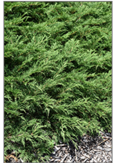
Northern Pride Russian Cypress