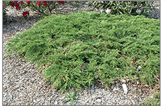
Northern Pride Russian Cypress