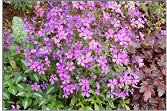
Plum Perfect Phlox flowers