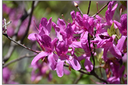
Lilac Lights Azalea flowers