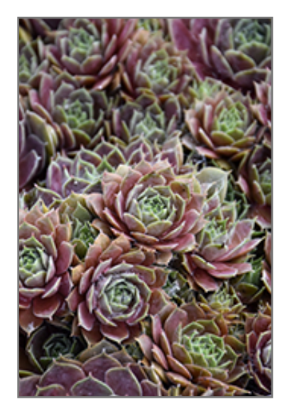
Purple Beauty Hens And Chicks