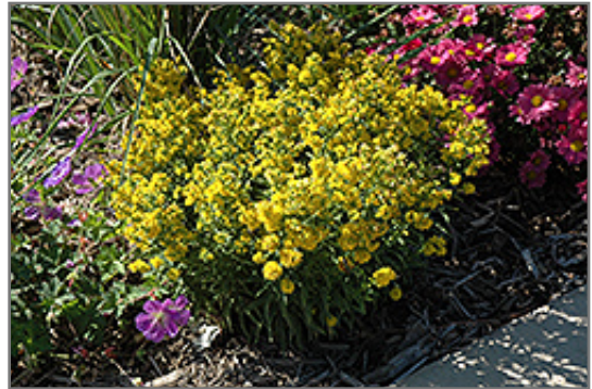
Goldrush Goldenrod in bloom