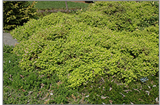
Golden Elf Spirea

Golden Elf Spirea is recommended for the following landscape applications;