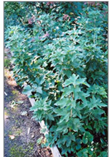
Ben Nevis Black Currant