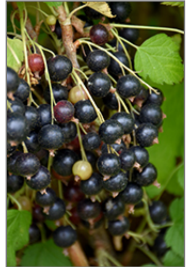
Ben Nevis Black Currant fruit

Ben Nevis Black Currant has rich green deciduous foliage on a plant with a round habit of growth. The lobed leaves turn yellow in fall. It features an abundance of magnificent black berries from mid to late summer.