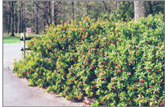
Wavy-leaved Chinese Stranvaesia fruit