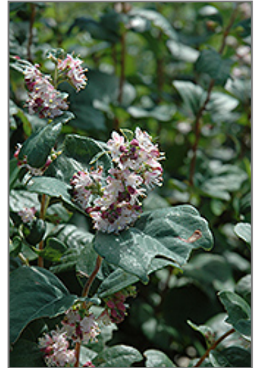
Wolfberry flowers

Wolfberry will grow to be about 4 feet tall at maturity, with a spread of 5 feet. It tends to fill out right to the ground and therefore doesn't necessarily require facer plants in front. It grows at a fast rate, and under ideal conditions can be expected to live for approximately 15 years.