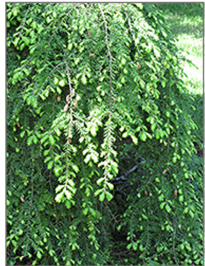
Sargent's Weeping Hemlock foliage