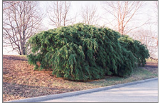
Sargent's Weeping Hemlock

Sargent's Weeping Hemlock is recommended for the following landscape applications;