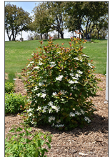
Redwing Highbush Cranberry in bloom