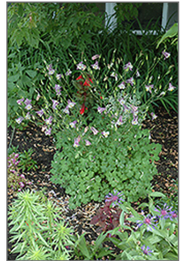
Common Columbine in bloom