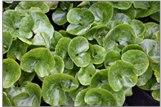
European Wild Ginger foliage