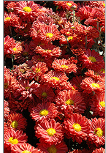
Dark Bronze Daisy Chrysanthemum flowers