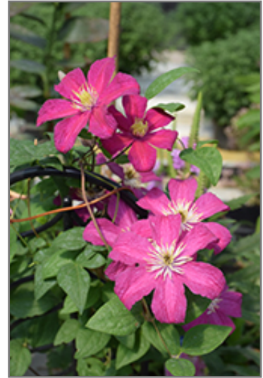
Barbara Harrington Clematis flowers