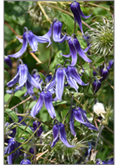
Solitary Clematis flowers