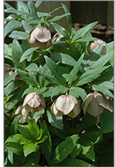
Sopron Hellebore flowers

Buttercup-type dangling clusters of flowers are small and chartreuse colored, emerge in late winter and spring, one of the first flowers to come up in cool weather and a harbinger of spring; attractive metallic blue-green leaves, has a fetid odor