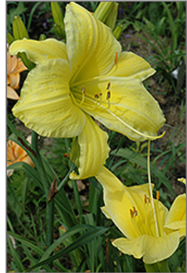
Big Bird Daylily flowers