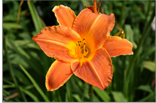
Bright Sunset Daylily flowers

Very bright red-orange trumpets with gold center streak and gold throat; ruffled edge; sturdy, strong, easy to care for, great grassy texture and form; good for the beginner gardener and the pro