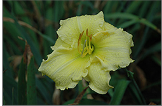
Brocaded Gown Daylily flowers