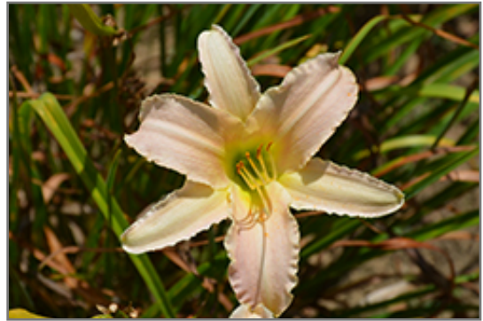
Luxury Lace Daylily flowers