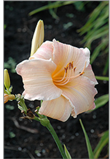
Luxury Lace Daylily flowers