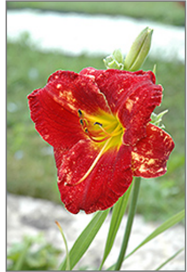
Red Poinsettia Daylily flowers