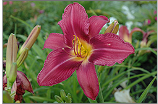
Russian Rhapsody Daylily flowers