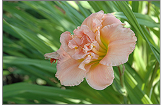
Siloam Double Delight Daylily flowers