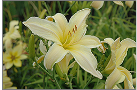
Sunrise Serenade Daylily flowers

Showy, large, reblooming, pale yellow/tan trumpets, infused with pale pink; green throat; sturdy, strong, easy to care for, great grassy texture and form; good for the beginner gardener and the pro