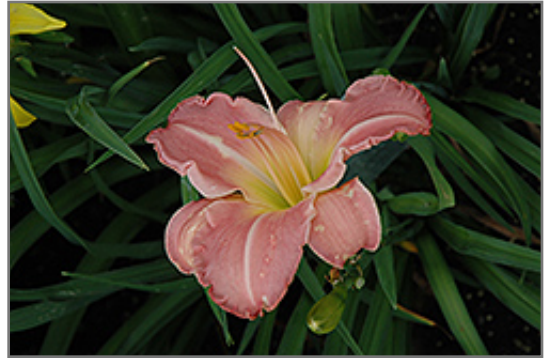
Taking Care Of Business Daylily flowers

Elegant, dusty rose trumpets with light midribs and yellow-green throat; sturdy, strong, easy to care for, great grassy texture and form; good for the beginner gardener and the pro