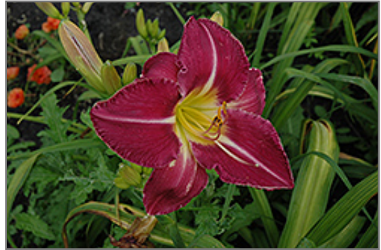
You Devil Daylily flowers