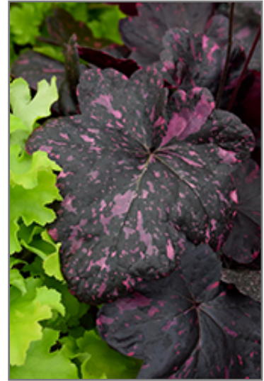
Midnight Rose Coral Bells foliage

Midnight Rose Coral Bells is recommended for the following landscape applications;