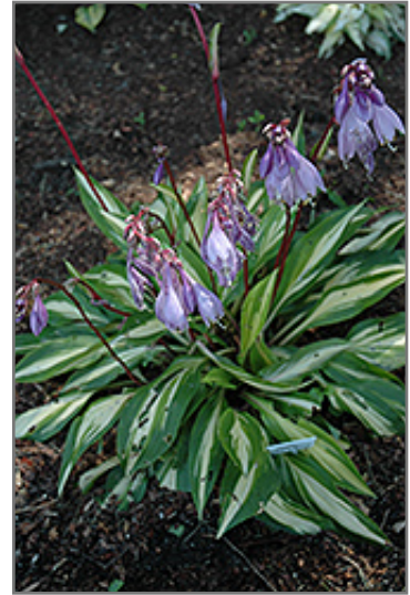
Cherry Berry Hosta in bloom