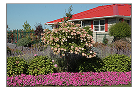
Tree Form Pee Gee Hydrangea in bloom

Tree Form Pee Gee Hydrangea features bold conical white flowers at the ends of the branches from mid summer to late fall. The flowers are excellent for cutting. It has green deciduous foliage. The pointy leaves do not develop any appreciable fall color.